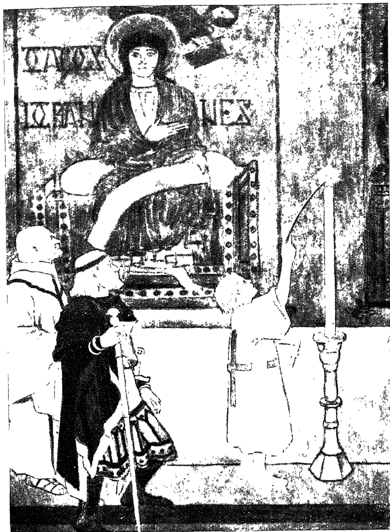
Alfred causes candles to be lit in churches